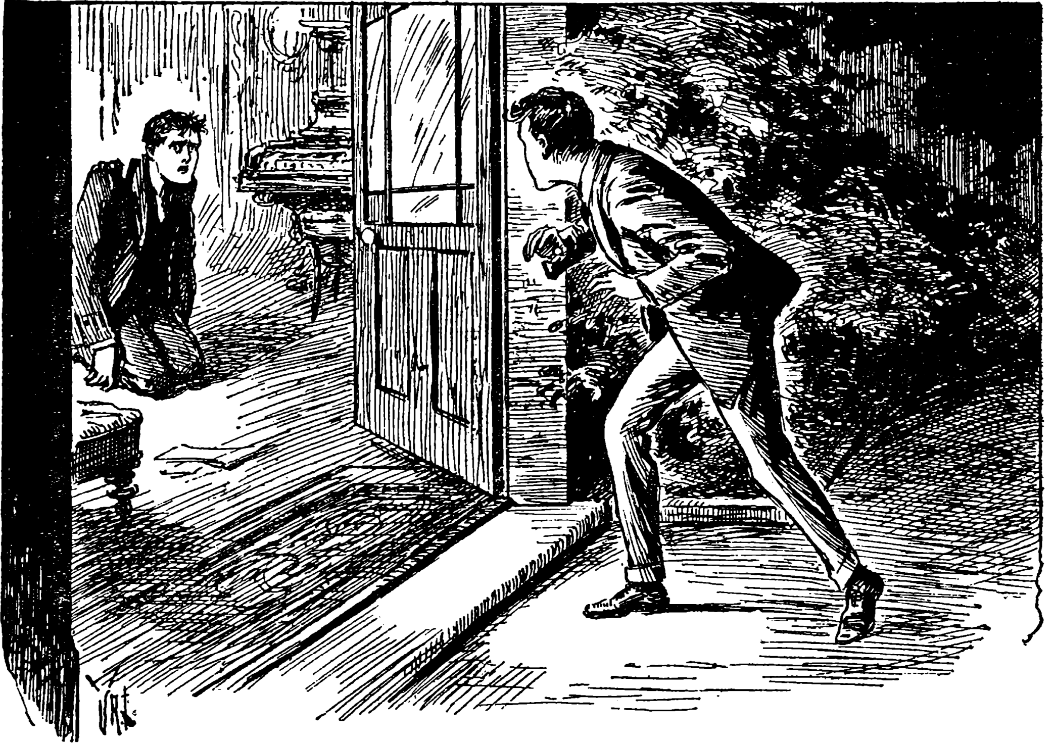
Gower was kneeling in the centre of the room when I staggered in, and he was staring at the window—at me, it seemed—with an expression of the utmost terror in his eyes. (See page 8.)

ing. I'm not nervous, but that room gives me the shudders."